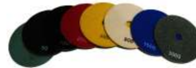
RESIN HAND PADS