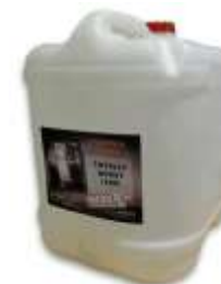
FLOOR TREATMENT PRODUCTS