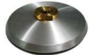
RESIN BACKING DISCS