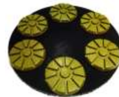
RIP CHANGE RESIN MOUNTING DISCS