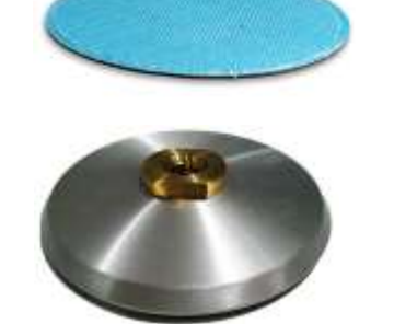
RESIN BACKING DISCS